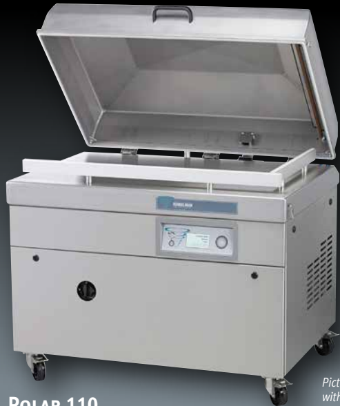
Picture: Polar 110 with option ACS