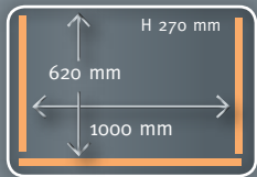
Option 2 x 620 mm 1 x 1000 mm seal