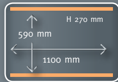
Option 2 x 1100 mm seal